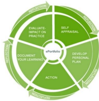
The five stage CPD cycle for pharmacists registered in Ireland

NOTE: You can begin a CPD cycle at one of three stages, Self-Appraisal, Develop a personal plan or Action.