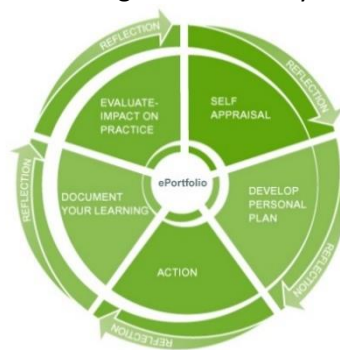
The five stage CPD cycle for pharmacists registered in Ireland

Recording your CPD systematically means that you have recorded it in a structured way following the five stage CPD cycle. You should reflect and record at each stage of the CPD cycle.